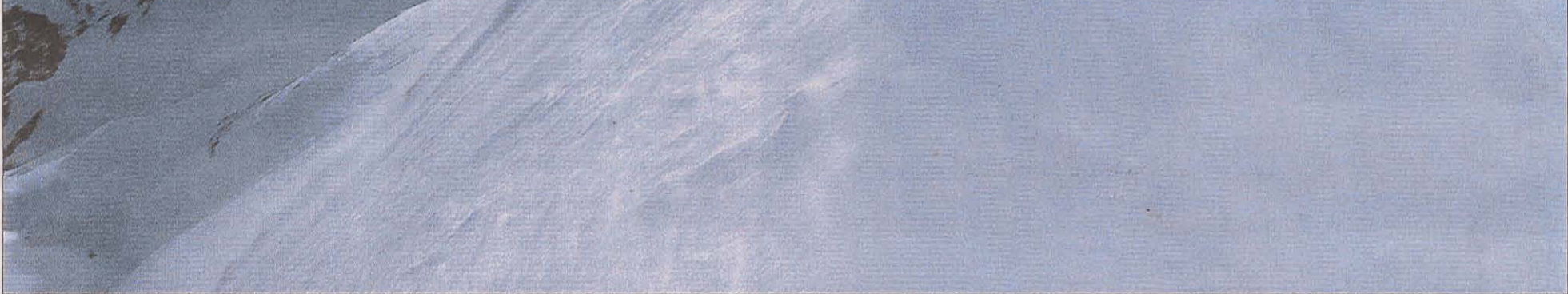
Head in the clouds ... (above) a lone skier takes on the piste at dusk in New Zealand and (below) enjoying the breathtaking mountainside view.