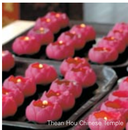
Thean Hou Chinese Temple

you visit the linking bridge on the 41st floor. Tickets are free, but queue between 8.30am and 11am to secure entry for views across the city and beyond.