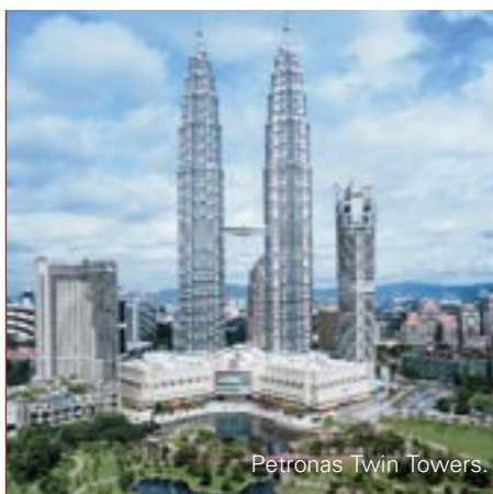
Petronas Twin Towers.

Public transport in Kuala Lumpur is modern, with both a rail system and a monorail. Taxis are metered, reasonable in price and air-conditioned to make those late nights home a breeze.