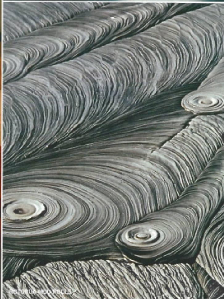
REPAIRS AND POOLS