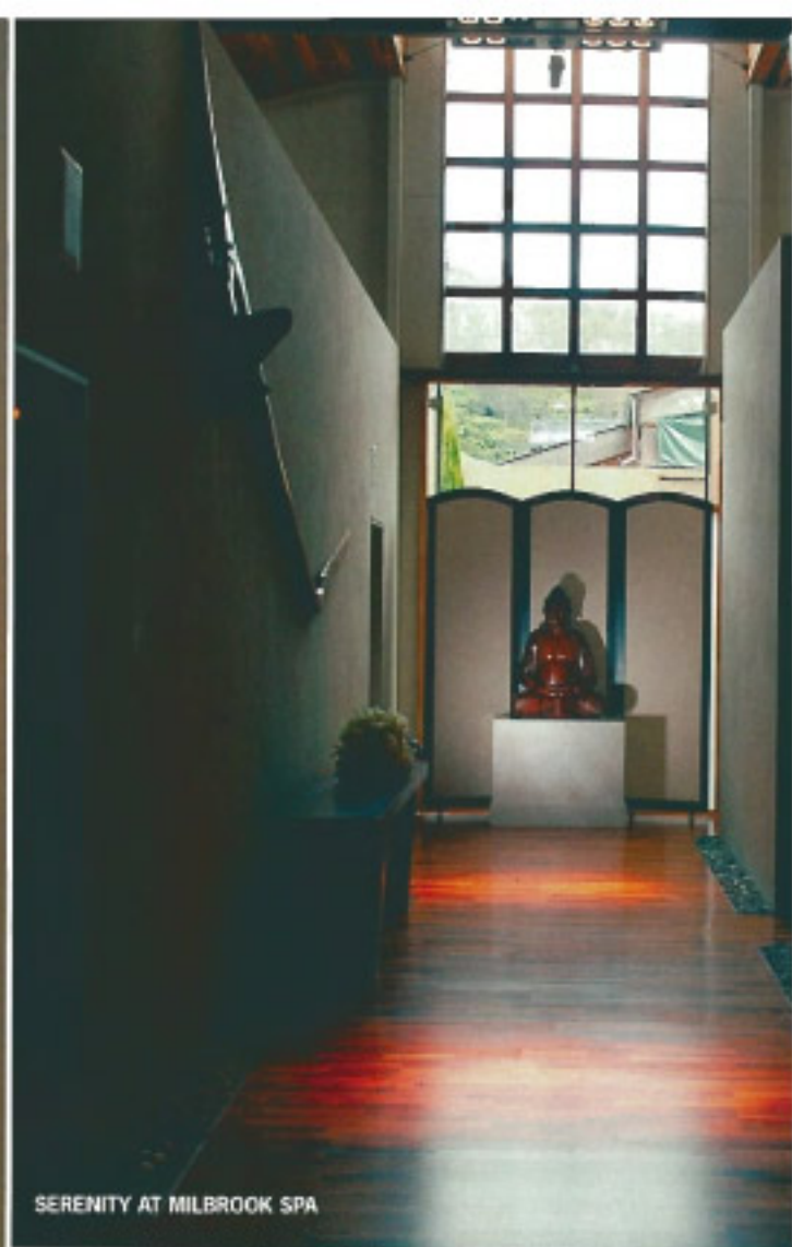
SERENITY AT MILBROOK SPA