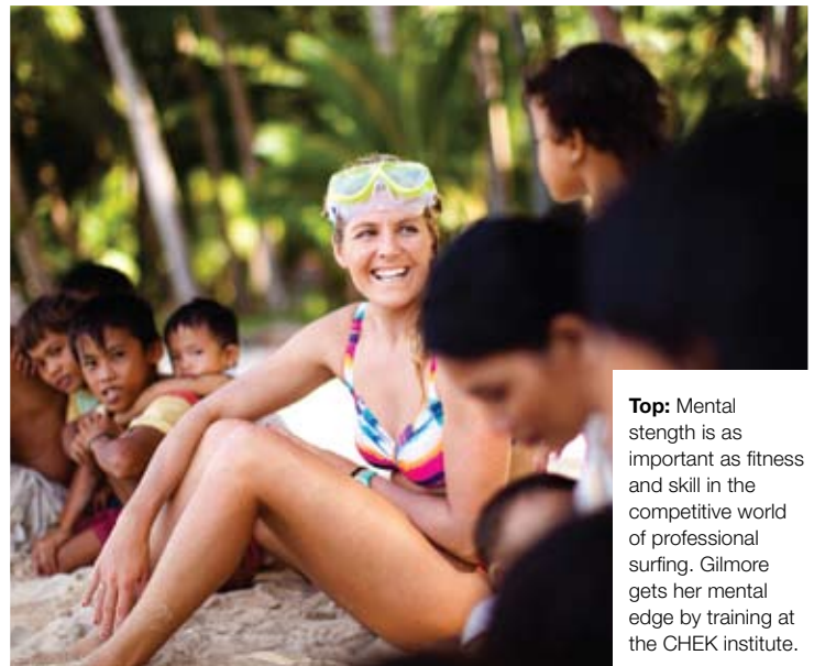
Top: Mental strength is as important as fitness and skill in the competitive world of professional surfing. Gilmore gets her mental edge by training at the CHEK institute.