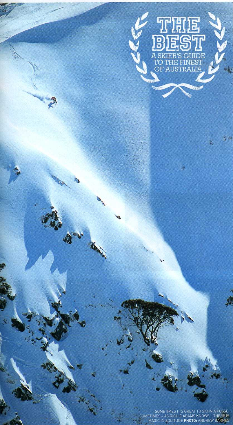
SOMETIMES IT'S GREAT TO SKI IN A POSSE. SOMETIMES - AS RICHIE ADAMS KNOWS - THERE IS MAGIC IN SOLITUDE

We're a naturally rivalrous bunch, we Aussies, swapping insults between States, convinced our own ski area is the best. I can't give a blue ribbon to any of them, they've all got their strengths and their hidden secrets. At the end of the day all that matters is if your face hurts from smiling. A smile is a ski secret you want the whole world to see, it means you got the best stuff.