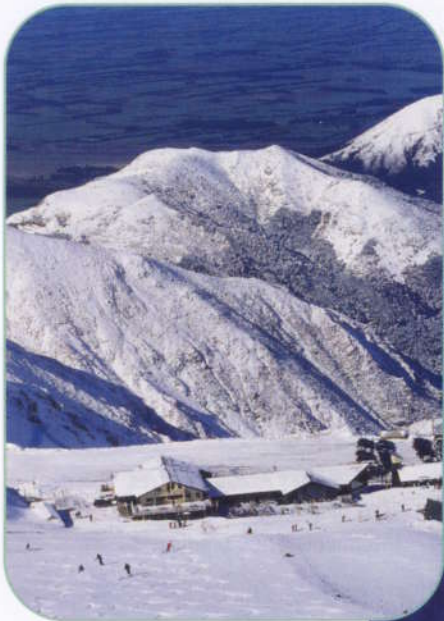
Main: Coronet Peak

Snowmaking to keep extensive coverage on the hill is a serious art at Coronet. A high-speed, six-seater launched last season gives skiers access to a full range of ski and board terrain. This is a mountain for