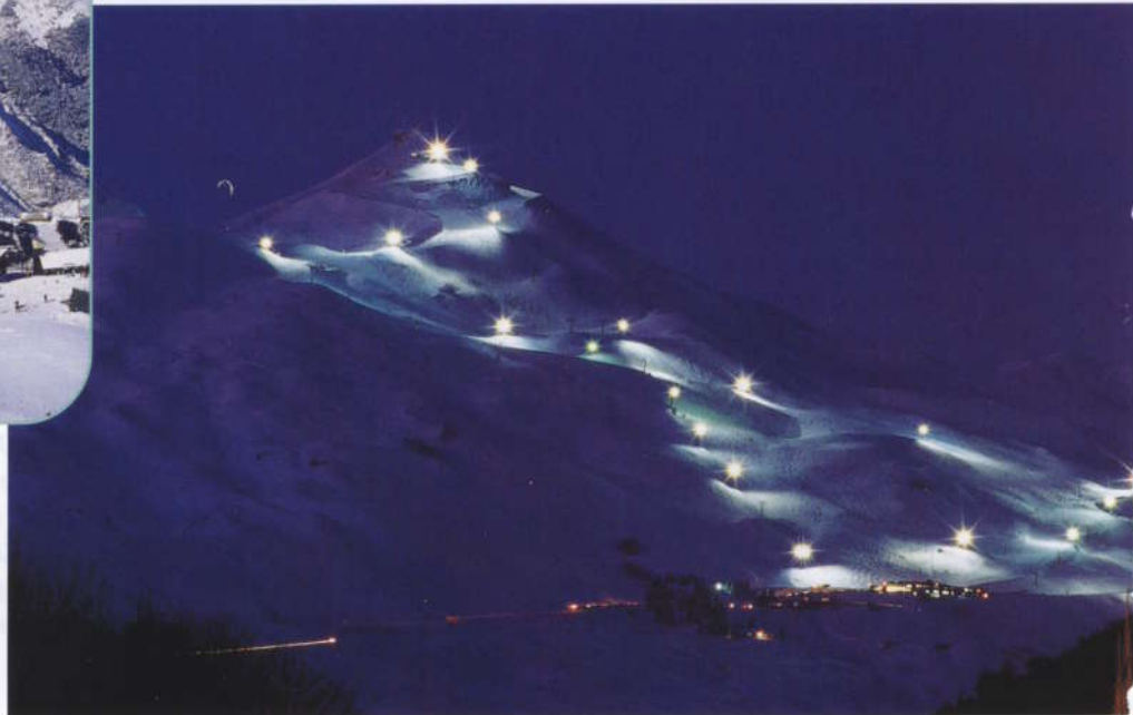
Above: Mt Hutt glows at night