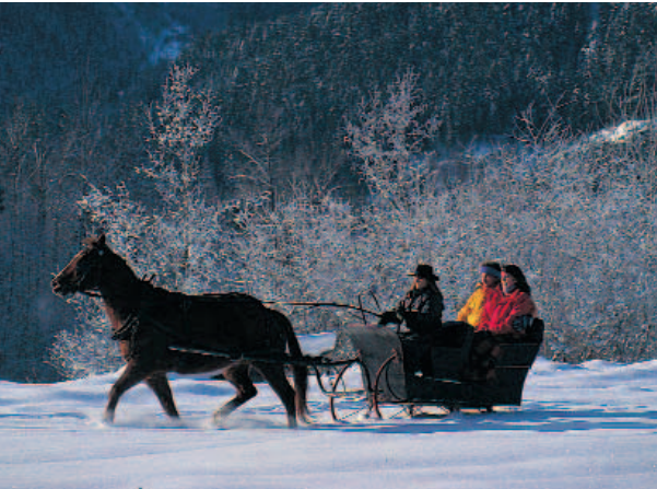
Bottom: Skiing at Marmot Peak near Jasper Below: Go for a sleigh ride at Whistler Right: The Lodge of Ten Peaks at Lake Louise in Canada