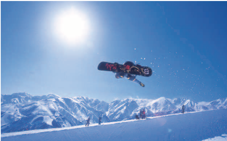
Above: The half pipe at Iwatake Resort, Hakuba Right: Magic conditions at Furano