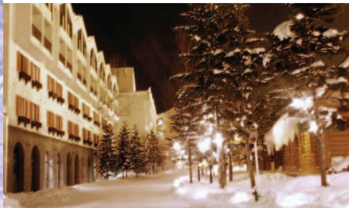
Above: Rusutsu is magical at night