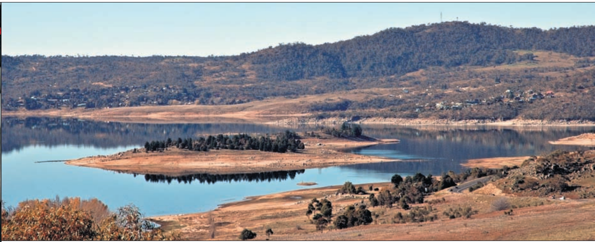
ON THE ROAD: (from far left) A four-wheel-drive is ideal for the slippery conditions; snow chains are a must for all vehicles and can be hired in most Cooma petrol stations; Lake Jindabyne.