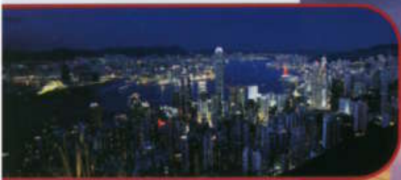
Main: Duk-Ling ride on the harbour in Hong Kong Above: The view over Hong Kong Harbour